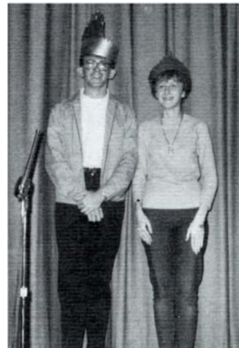
Sample of Hush Day Tag above, photo of Hush Day winners at right (identities no longer remembered.)