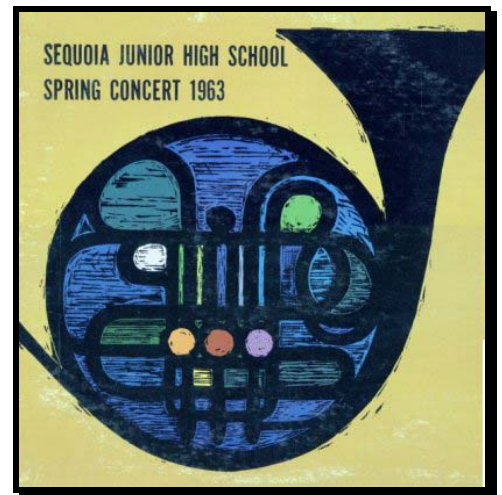
Recording jacket cover from the Spring 1963 Concert.